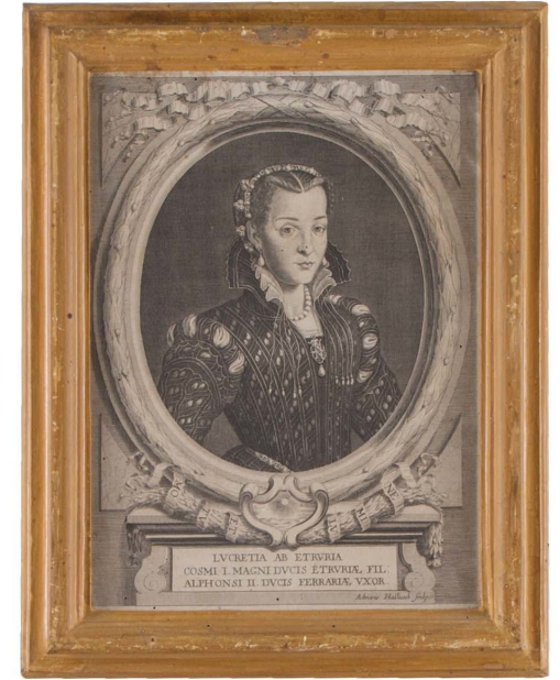
LUCRETIA AB ETRVRIA COSMI I. MAGNI DVCS ETRVIVS, FIL. ALPHONSI II. DVCS FERRARIE, VXOR.