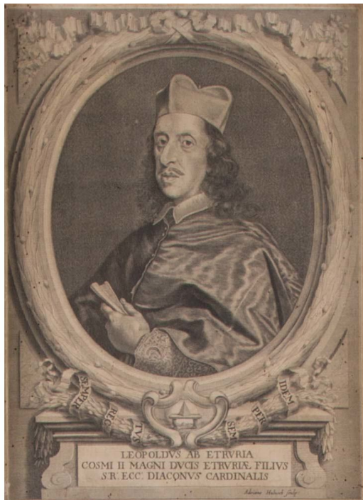
LEOPOLDVS AB ETRVRIA COSMI II. MAGNI DVCS ETRVRIE, FILIVS S. R. ECC. DIAQONVS CARDINALIS