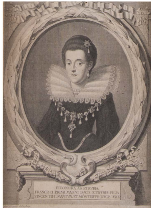
ELEONORA AB ETRVRIA FRANCISCI PRIMI MAGNI DVCS ETRVRIE, FILIA VINCENTII I. MANTVÆ ET MONTISFERR. DVCS ADEL.