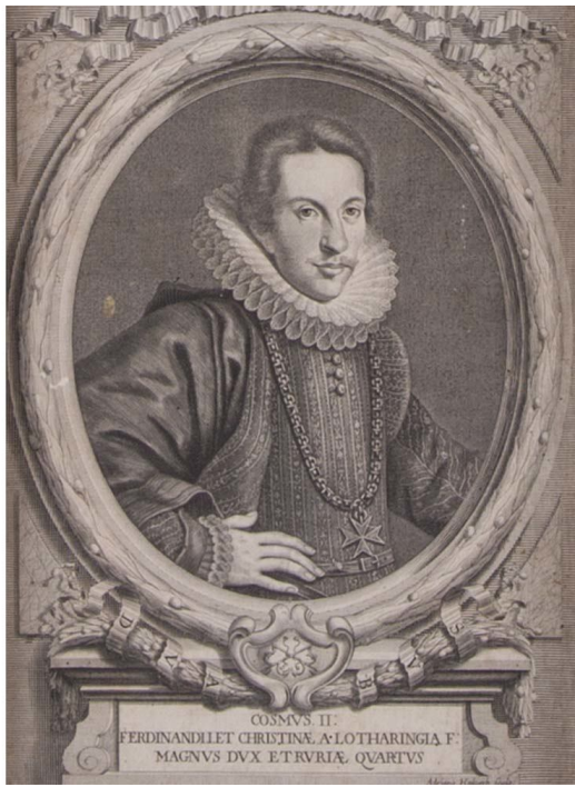
COSMVS II. FERDINANDI ET CHRISTINÆ A LOTHARINGIA F. MAGNVS DVX ETRVRIÆ QVARTVS