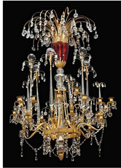
Lot 323, Sale 5605 LUSTRE IMPERIAL D'EPOQUE NEO-CLASSIQUE TRAVAIL RUSSE ATTRIBUE A JOHAN ZEKH Price Realized $ 810,000 / € 601,000