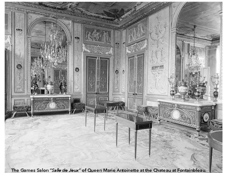
The Games Salon "Salle de Jeux" of Queen Marie Antoinette at the Chateau at Fontainebleau.